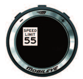
Speed Limit Indicator