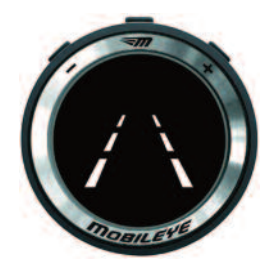
Lane Departure Warning